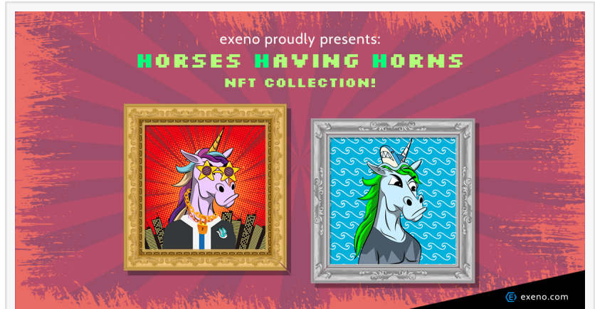
Exeno launches its "Horses Having Horns" NFT collection.

MAJURO, MARSHALL ISLANDS, March 13, 2023 /EINPresswire.com/ -- Exeno , a pioneer within the web3 DeFi & Commerce technology space, is launching a new NFT collection, "Horses Having Horns", to both continue to drive innovative approaches within the industry and celebrate its 2nd-anniversary.