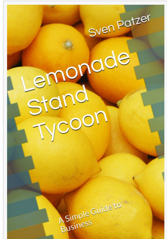
Lemonade Stand Tycoon: Front Cover