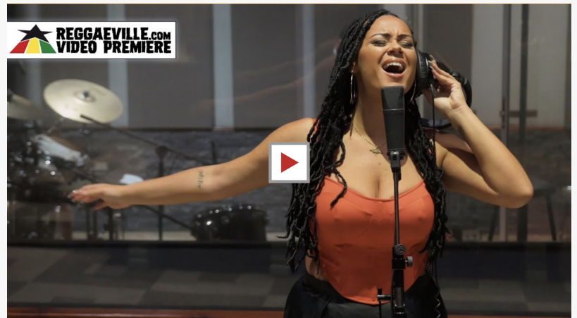
Reggaeville Video Premiere

This press release can be viewed online at: https://www.einpresswire.com/article/621853426 EIN Presswire's priority is source transparency. We do not allow opaque clients, and our editors try to be careful about weeding out false and misleading content. As a user, if you see something we have missed, please do bring it to our attention. Your help is welcome. EIN Presswire, Everyone's Internet News Presswire™, tries to define some of the boundaries that are reasonable in today's world. Please see our Editorial Guidelines for more information.