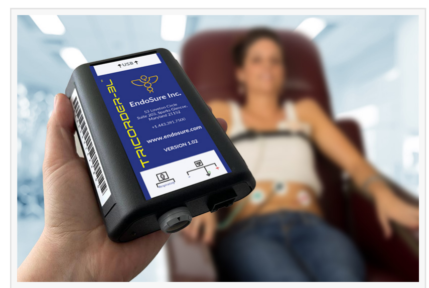
The EndoSure Test is non-invasive, takes just 30 minutes to perform and the result is instantly available.

Endometriosis affects over 10% of women globally and accounts for why 7 out of 10 women visit pelvic pain clinics. Endometriosis is also