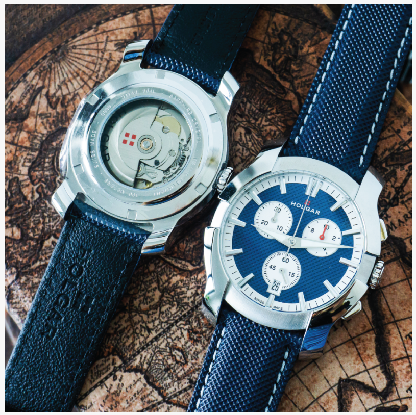
Blue & White Chronograph 44mm

The Men's collection's Chronographs, Sport Automatics, and Classic Automatic models all have strong, crisp lines that are supplemented by polished indexes for the sport range or subdued by elegant Roman numerals for the classic range. The Women's Spectrum collection also uses applied indices, casings made of 5N IP Plated or 904L stainless steel, and dial finishes with vivid hues modeled after a "sunburst" pattern.