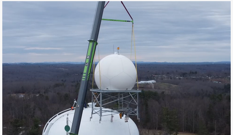
Climavision installs new radar in Cumberland County, Tennessee

This press release can be viewed online at: https://www.einpresswire.com/article/621930926