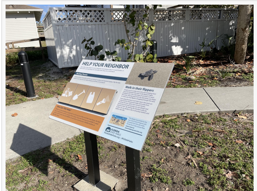
Sea turtle interpretive signage at Sebastian Inlet State Park.