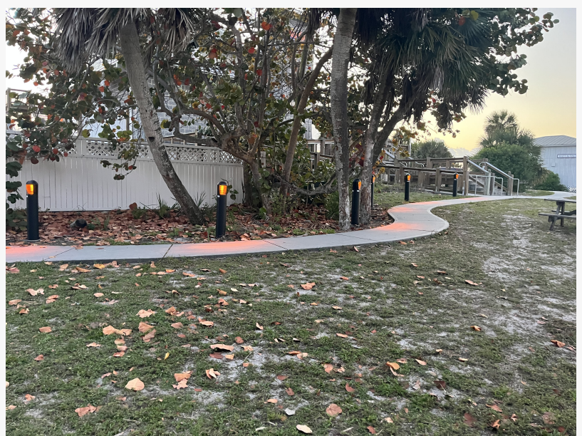
Sea turtle-friendly lighting at Sebastian Inlet State Park.

The Florida State Parks Foundation, founded in 1993 as Friends of Florida State Parks and renamed in 2018, is a 501(c)(3) nonprofit corporation whose mission is to support and help sustain the Florida Park Service, its 175 award-winning parks and trails, local Friends groups and more than 20,000 park volunteers.