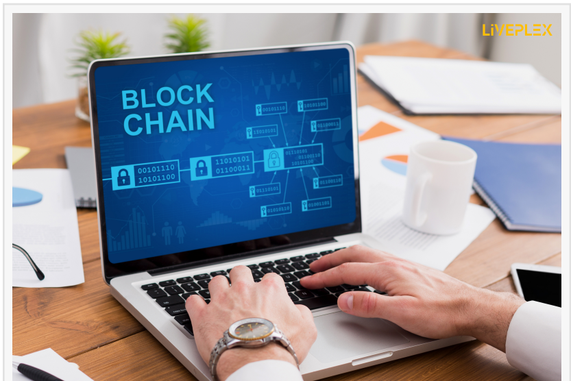
Web3.0 Finance with Liveplex