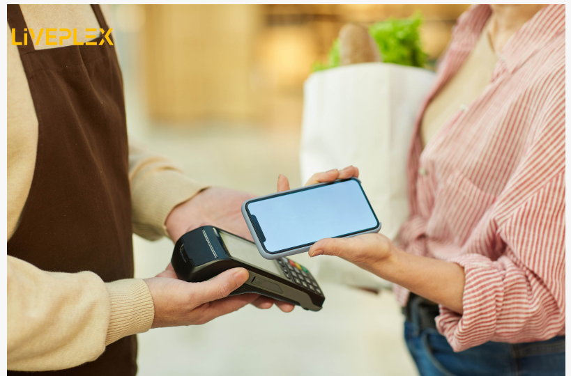
Web3 is coming to payments with Liveplex Stack