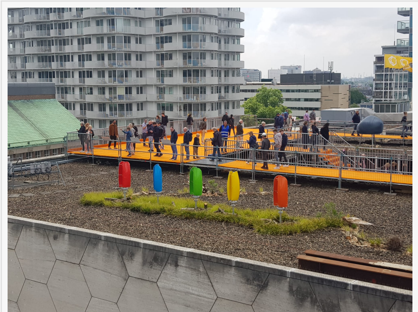
Flower Turbines at Rotterdam Roof Days

Flower Turbines is a US company with an important branch in the EU that has the goal of making small wind as powerful a force in renewable energy as solar by using its multiple patents to create a wind turbine that meets all the needs of urban and suburban environments. It combines aerodynamic innovations with beautiful design, low noise, and bird friendliness. Unlike