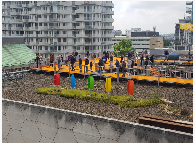
Flower Turbines at Rotterdam Roof Days