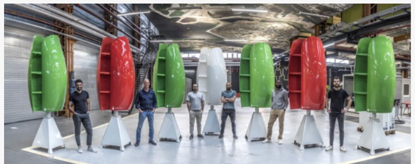
Flower Turbines Panorama