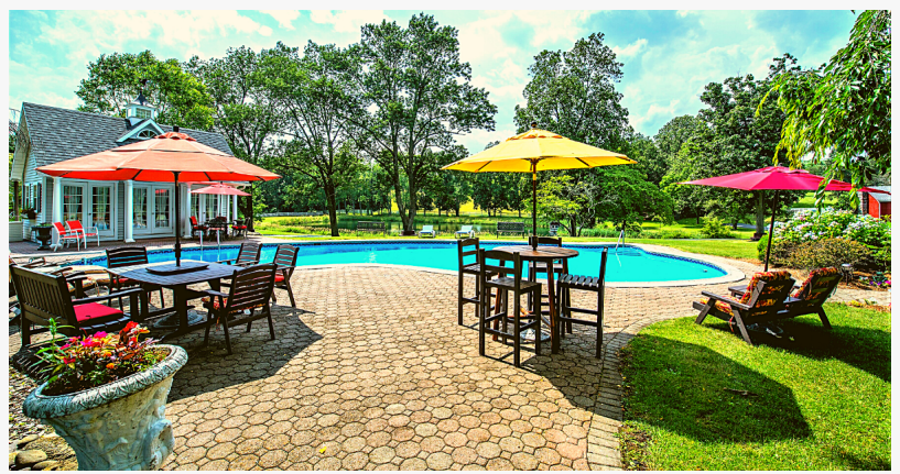
Pool and Cabana

The grounds feature miles of trails offering endless outdoor recreational activities: horseback riding, hiking, berry picking, ATV riding, snowmobiling, snowshoeing, ice skating, and ponds for ice-skating and hockey in the winter. There are also designated areas for skeet shooting and a pistol/archery range on the property. For a more refined afternoon, enjoy a game of tennis on the court complete with a guest viewing area at the elegant Gazebo. The stable, located within a short walking distance, features a riding arena and dressage area. Two magnificent spring-fed ponds, teeming with large-mouth bass and other fish, offer hours of thrilling angling experiences. For those seeking a more relaxed pace, a stunning lighted water fountain and swan boats provide the perfect venue for a tranquil 1.5 acre pond cruise.