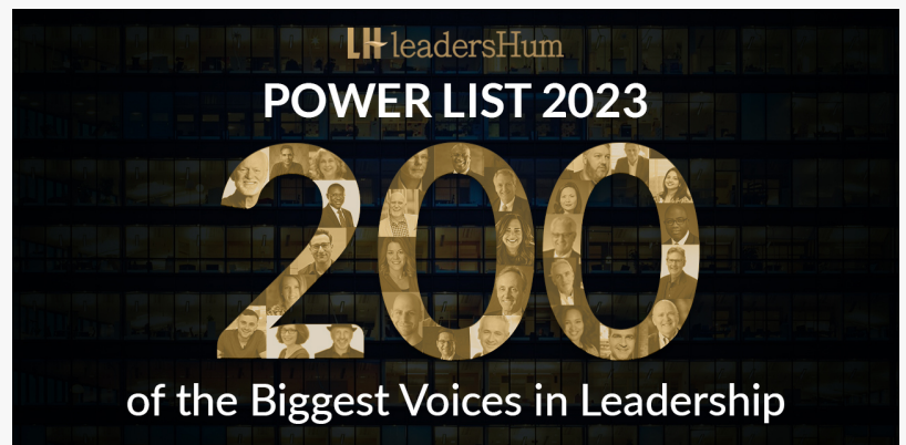
Top 200 Biggest Voices in Leadership