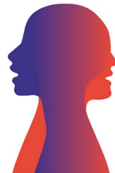
Award-winning Humony Leadership Book