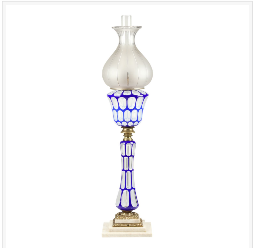
Cobalt double overlay kerosene stand lamp, made in America circa 1860-1880, overall 27 inches tall, blue cut to white cut to colorless urn-shaped front, maker unknown (est. CA$9,000-$12,000)

This press release can be viewed online at: https://www.einpresswire.com/article/622181338