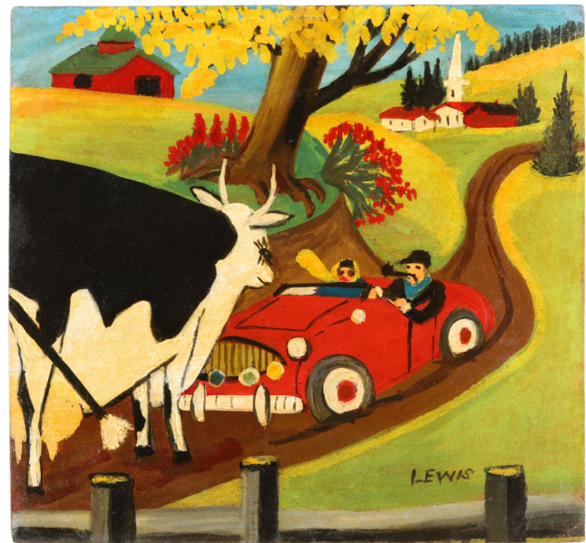
Oil on board painting by the acclaimed Canadian folk artist Maud Lewis (1903-1970), titled Traffic Jam, an 11 ½ inch by 12 inch early and humorous work (est. CA$30,000-$35,000).

As expected, the day’s anticipated top lot is an oil on board painting by the acclaimed Canadian