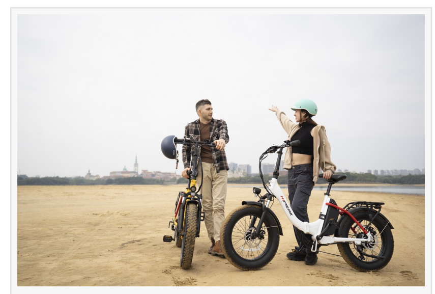
HIPEAK BONA & ELIAS FOLDING EBIKES

Unfortunately, up to this point, the laws regarding electric bicycles in the United States have not been very easy to understand and may even be somewhat confusing. It doesn't take much research to discover that electric bike laws and regulations vary from place to place, as the government is large and often multi-layered. Just because one state or city has certain views on electric bicycles does not mean that other states or cities will have the same views.