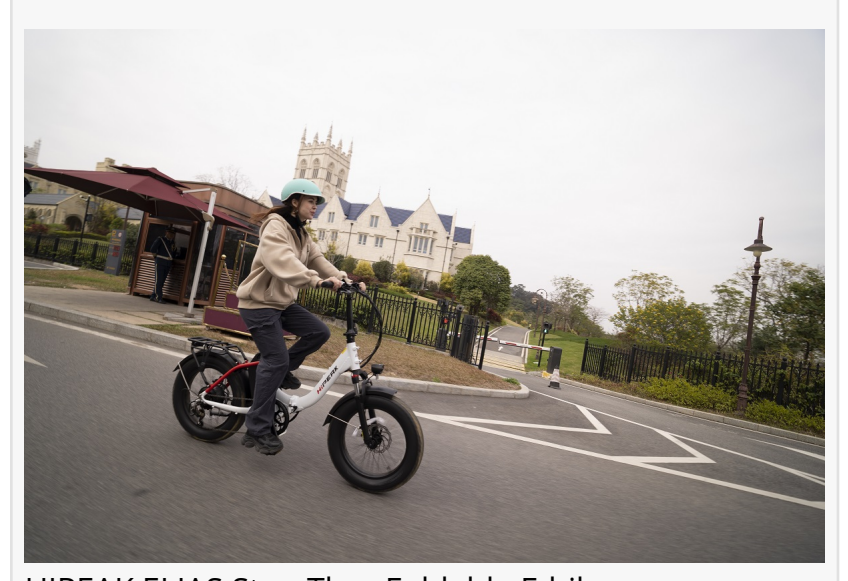
HIPEAK ELIAS Step-Thru Foldable E-bike

Electric bike related laws are still under development