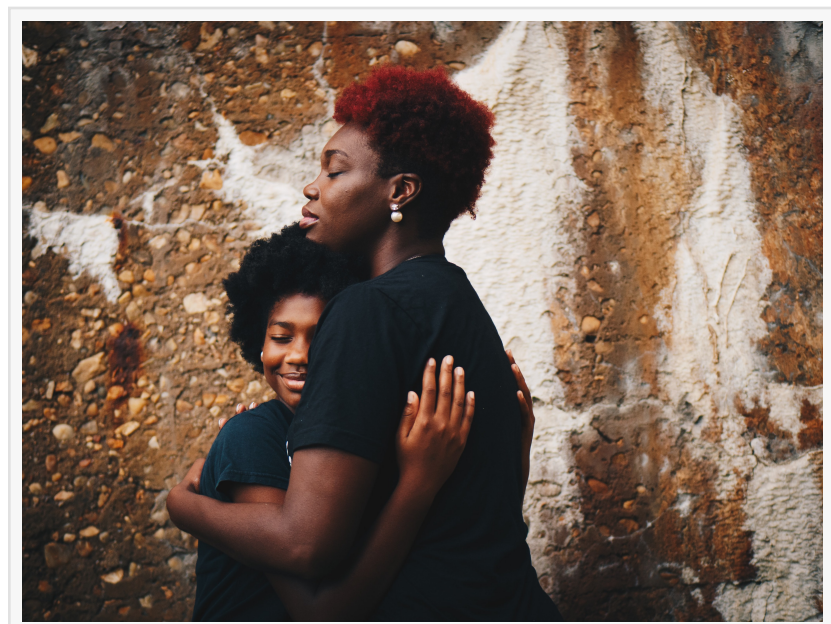
The interest of parents in the care, custody, and control of their children is recognized as a fundamental liberty protected by the Due Process Clause of the Fourteenth Amendment to the United States Constitution.

This press release can be viewed online at: https://www.einpresswire.com/article/622338823