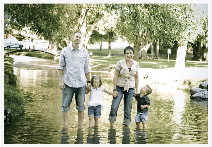
The most recent report on the Baker Act revealed that there were around 38,000 initiations on children in a single year, with over 4,000 of these children under the age of 10.

"There are numerous other rights delineated in the Parental Rights booklet," says Stein. "Considering approximately 38,000 Baker Acts involved children in Florida in the years 2020-2021, it's important for all parents to know their rights." (2)