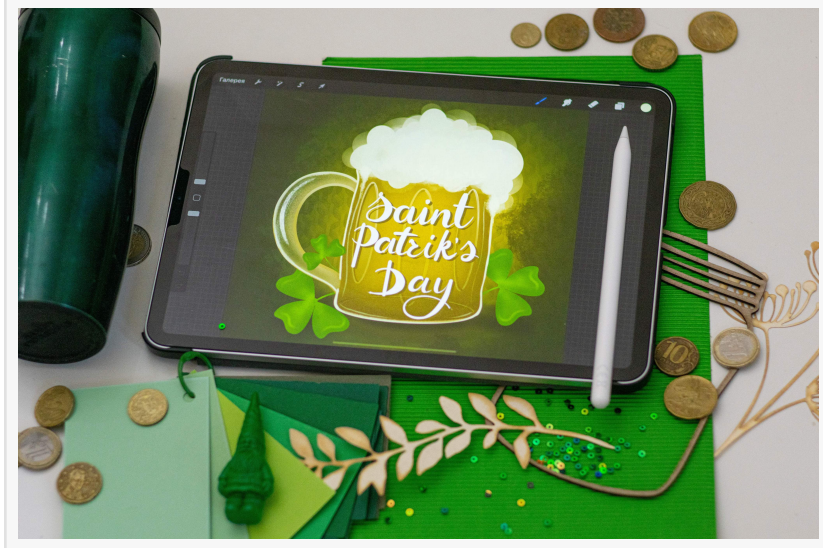
This Saint Patrick's Day, Citizens Commission on Human Rights (CCHR) invites you to join them for a free family-friendly St. Patrick's Day Scavenger hunt at their Clearwater office.