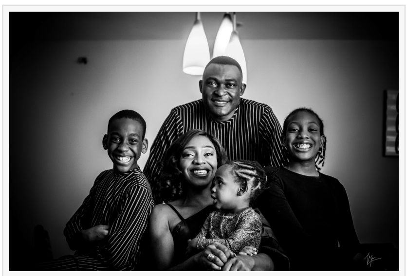
It is a fundamental right of parents to direct the mental health of their minor children.

protect children from inappropriate Baker Acting. (1)