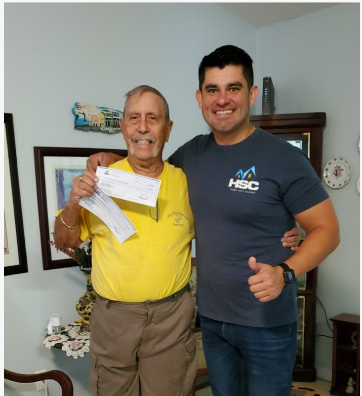
HSC Happy Customer