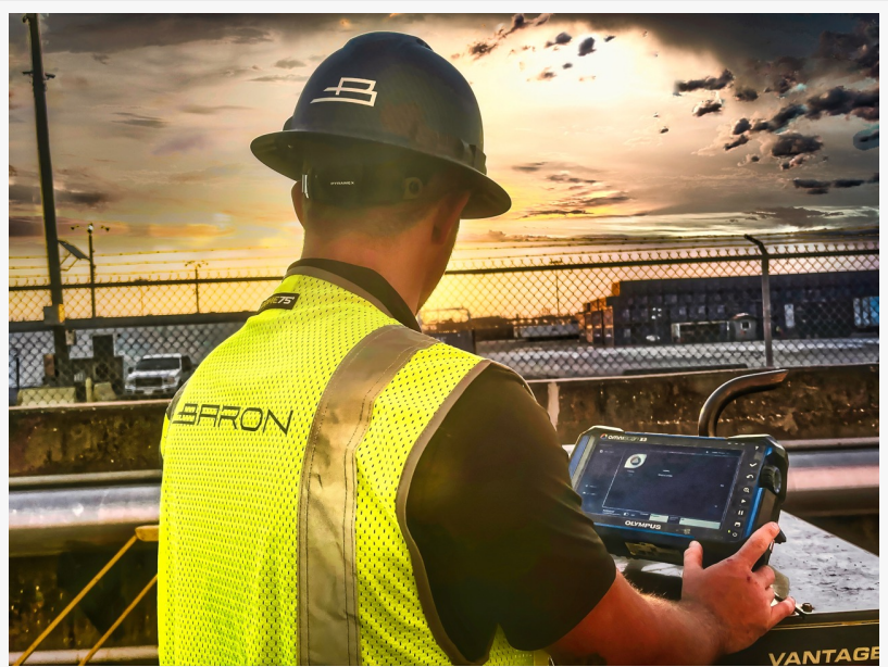
Advanced PAUT inspector calibrates Olympus X3 at dawn, ready to ensure safety and precision in the world of non-destructive testing.

UNITED STATES, March 15, 2023 /EINPresswire.com/ -- Global non-destructive testing (NDT) leader, Baron NDT , is pleased to announce significant growth in the aerospace and industrial sectors. With innovative testing solutions, advanced technology, and unparalleled customer service, Baron NDT has become the go-to choice for companies seeking accurate, reliable, and cost-effective NDT services.