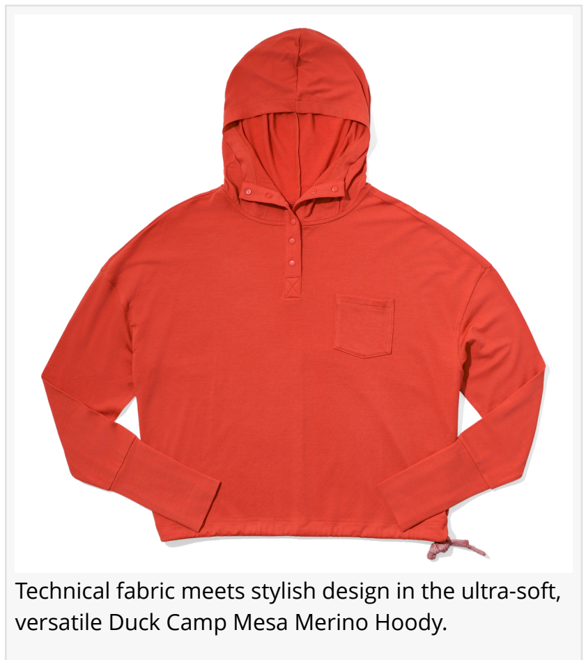
Technical fabric meets stylish design in the ultra-soft, versatile Duck Camp Mesa Merino Hoody.

Mesa Merino Hoody – Technical fabric meets stylish design in this ultra-soft, versatile merino hoody. Equally at home as a thin base layer under a jacket or worn on its own, the Mesa Merino Hoodie combines the warmth, odor control and moisture wicking performance that merino is known for with high UPF sun protection. Perfect for long days on the water, this garment features a full snap hood for UPF 86+ protection and drawstring bottom for secure fit when needed. MSRP: $110.