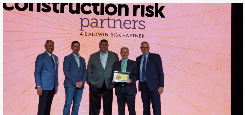
Sports Turf Company accepting AGC of America Award

Sports Turf specializes in the construction and installation of sports surfaces, including natural grass and artificial turf fields, tennis courts and track surfaces. In addition, Sports Turf Company serves as a consultant and owners' advocate through the entire process of selecting the best facility solutions and surfaces to meet owners' specific needs. The company continues evolving to provide higher-performing, safer and more durable athletic facilities for its clients.