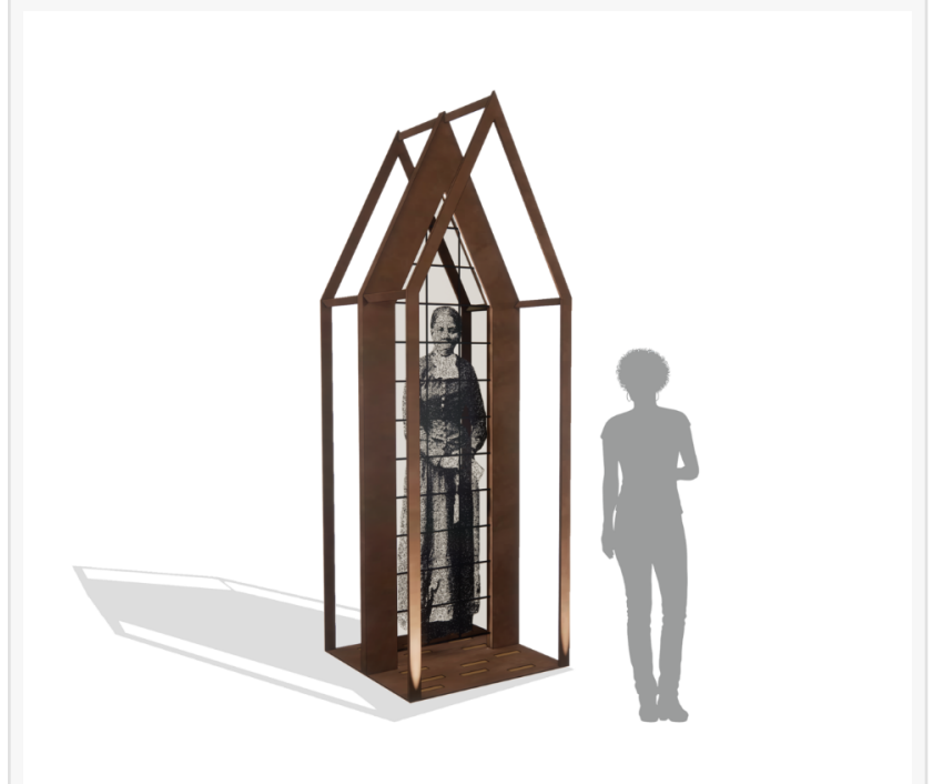
Rendering of 12-foot statue to be unveiled on March 16th