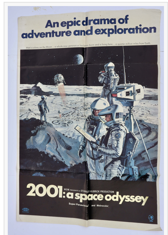
The auction will include style A and B one-sheet posters for Stanley Kubrick's sci-fi epic 2001: A Space Odyssey (MGM, 1968). Style B (shown) is 27 inches by 41 inches.

Both Beatles movies that featured the Fab Four in live acting roles will be in the sale, including a three-sheet poster for HELP! (United Artists, 1965), in near-mint condition with vibrant colors, two panels as originally printed; and a one-sheet poster for A Hard Day's Night (United Artists,