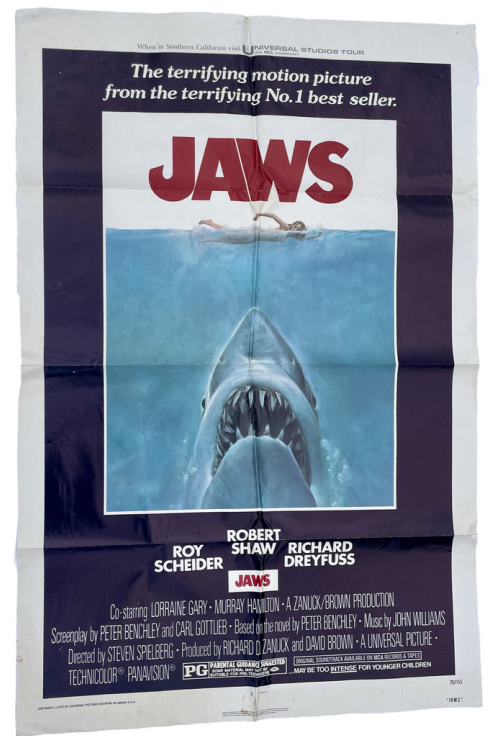
One-sheet poster for JAWS (Universal, 1975), directed by Steven Spielberg, with Roy Scheider, Robert Shaw and Richard Dreyfuss, visually arresting, with shark graphic.

This press release can be viewed online at: https://www.einpresswire.com/article/622380963