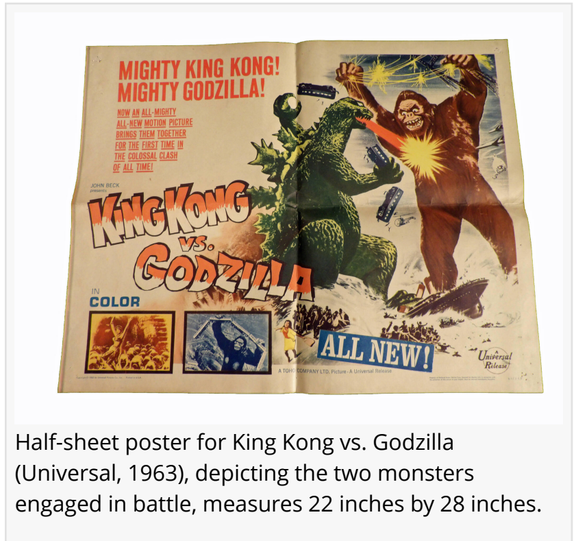
Half-sheet poster for King Kong vs. Godzilla (Universal, 1963), depicting the two monsters engaged in battle, measures 22 inches by 28 inches.

MACON, GA, UNITED STATES, March 15, 2023 /EINPresswire.com/ -- Newly formed Opportunities 2 Auction House, based in Macon, will introduce itself to the collecting community with an online auction of original, unrestored vintage movie posters on Saturday, April 15th, starting at 10 am Eastern time. Over 140 lots will come up for bid from a single consignor. The catalog is live now and open for bidding, on LiveAuctioneers.com .