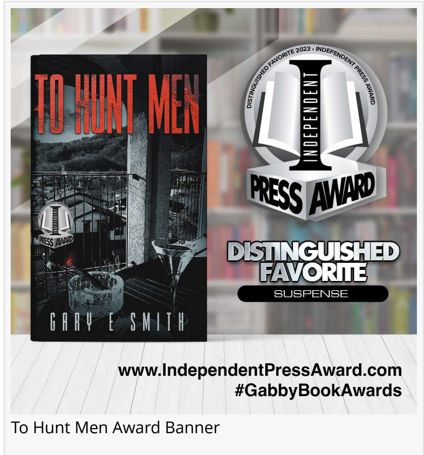
To Hunt Men Award Banner