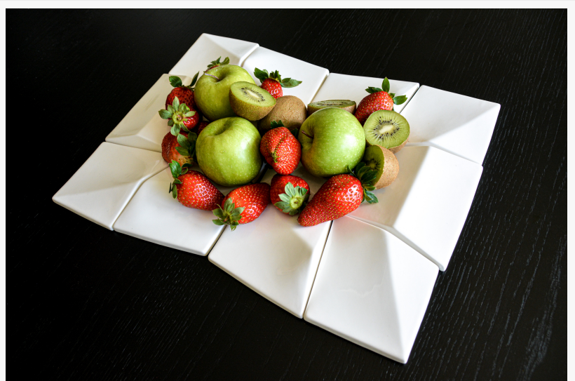
Galia twelve piece set

Galia was carefully curated and produced creations from the diverse and eclectic selection of art and design work created by students at the finest schools in the world and showcased on