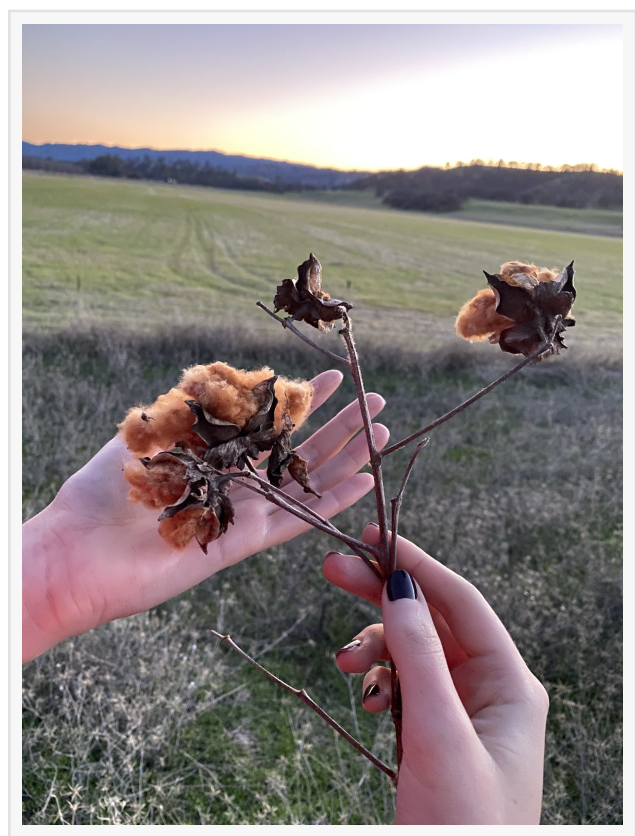
Higher Loyalty's heritage red-brown cotton varietals are antimicrobial and non-allergenic.

This press release can be viewed online at: https://www.einpresswire.com/article/622463548 EIN Presswire's priority is source transparency. We do not allow opaque clients, and our editors try to be careful about weeding out false and misleading content. As a user, if you see something we have missed, please do bring it to our attention. Your help is welcome. EIN Presswire, Everyone's Internet News Presswire™, tries to define some of the boundaries that are reasonable in today's world. Please see our Editorial Guidelines for more information. © 1995-2023 Newsmatics Inc. All Right Reserved.