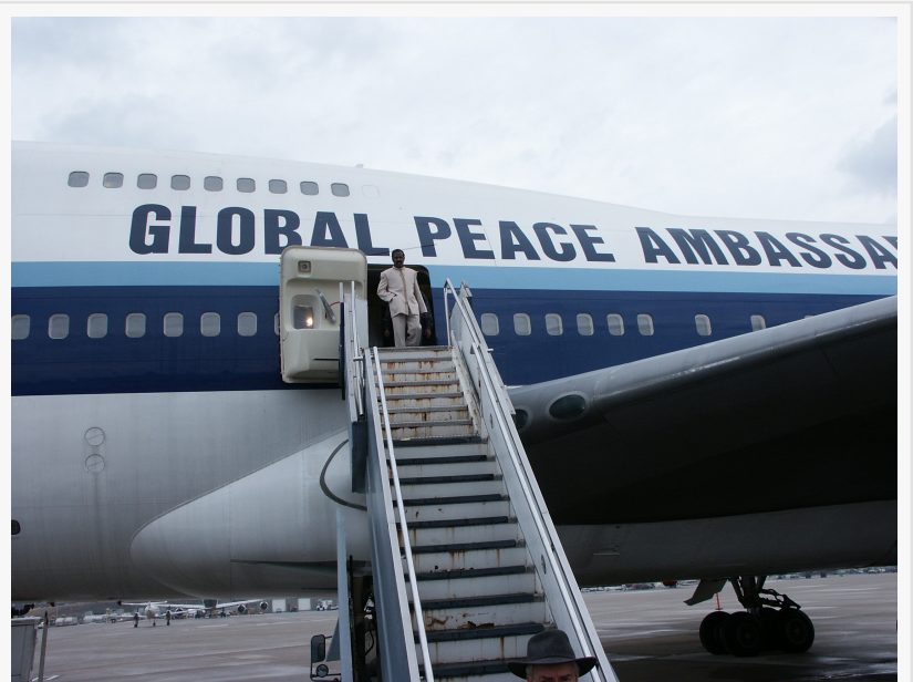
Global Peace One