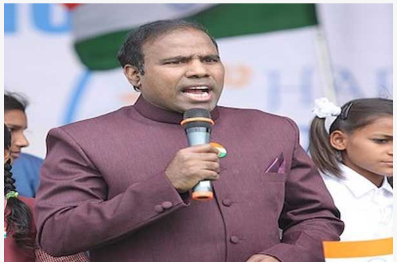
KA Paul Speaking

Dr. Paul has just released a video pleading with the Chief Justice of India to intervene and stop the Supreme Court's order on 17th March and to save him from the hands of these political killers and give him a chance to hear the truth and the facts about why he entered politics: to save the Indian economy, democracy, and secularism, and to protect India from corrupt and crooked politicians.