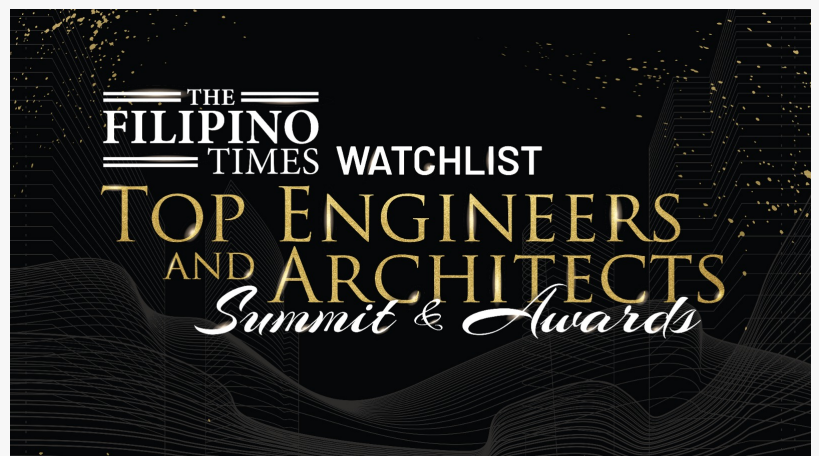
The Filipino Times Watchlist: Top Engineers and Architects Summit & Awards