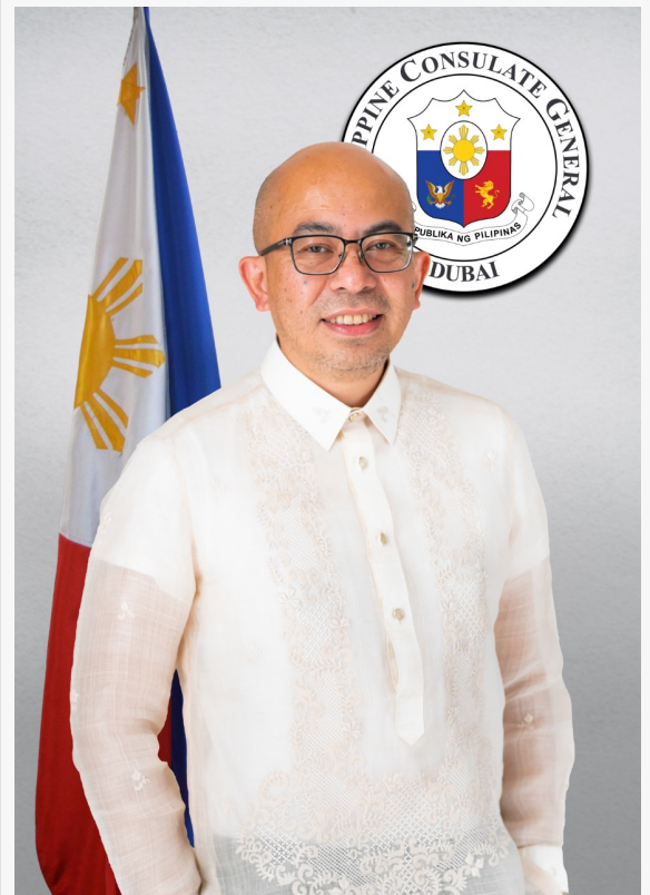
Hon. Renato Dueñas Jr., Philippine Consul General in Dubai