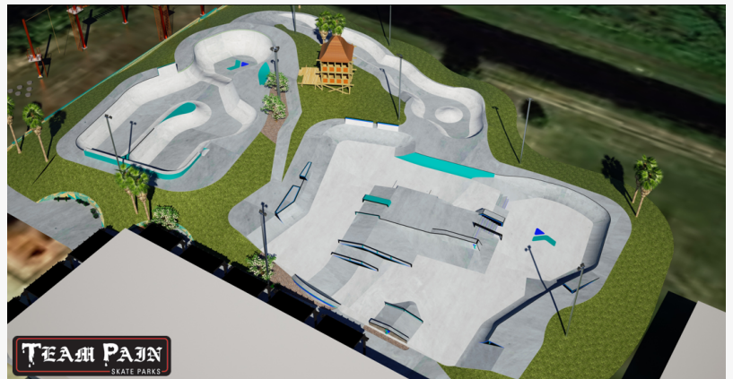
YMCA of the Palm Beaches Skate Park Design by Team Pain

This press release can be viewed online at: https://www.einpresswire.com/article/622575004