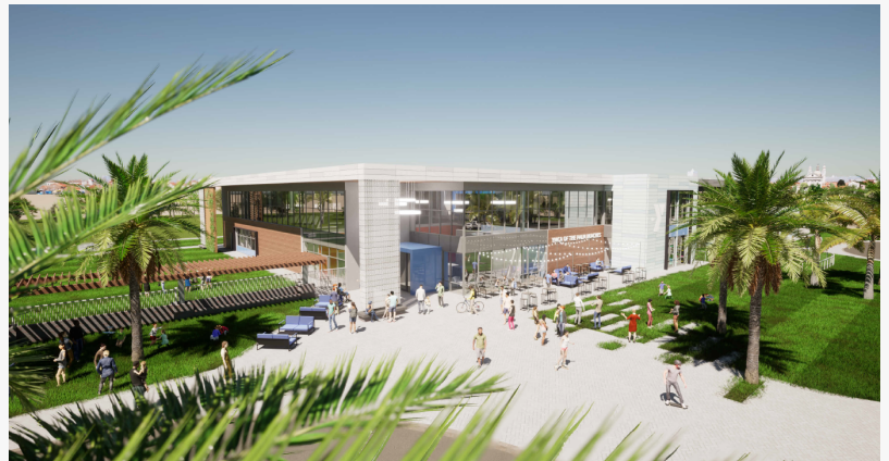
YMCA of the Palm Beaches New Community Center Rendering

WEST PALM BEACH, FL, USA, March 16, 2023 /EINPresswire.com/ -- The YMCA of the Palm Beaches announced a $46 million capital project, in partnership with the Palm Beach County Parks & Recreation department, that will relocate and dramatically expand its flagship branch.