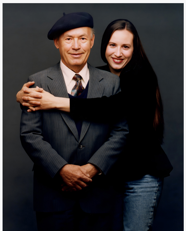
Grgich Hills Estate to celebrate the 100th birthday of legendary Napa Valley winemaker Miljenko "Mike" Grgich starting on April 1, 2023.

On May 19, 2023, Mike's close friends, colleagues, associates and select members of the media will celebrate "A Glass Full of Miracles," an exclusive event where select wines that represent Mike's career in the wine industry will be featured. These include a selection of Grgich Hills Estate library wines, as well as those that he worked on while employed at other wineries- including Beaulieu Vineyard where he worked with Andre Tchelistcheff, his tenure at the Robert Mondavi Winery where he crafted the now famous "Fume Blanc" and 1969 Award Winning Cabernet Sauvignon, and finally at Chateau Montelena where he created the wine that won the "Judgement of Paris." Many winemaking associates will be sharing their favorite personal stories about friendships with Mike and the wines they created with him. The following day, "A Life Full of Miracles" celebration will feature Croatian music and dancers in traditional costume, entertainment, and food created by renowned Iron Chef Masaharu Morimoto. Approximately 400 invitation-only guests will be attending on May 20, 2023, on the open-air patio at The Ranch House at Grgich Hills Estate.