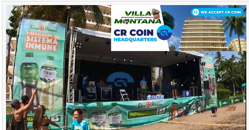
The Crypto Hotel, also known as Villa Montana, hosted a large family event that featured on-stage promotion of CR Coin.

The blockchain boasts an average transaction confirmation speed of 3 seconds, making it one of