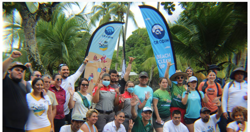
CR Coin used to incentivize beach cleanups in Costa Rica with the support of Radio Urbano, promoting a sustainable and eco-friendly future