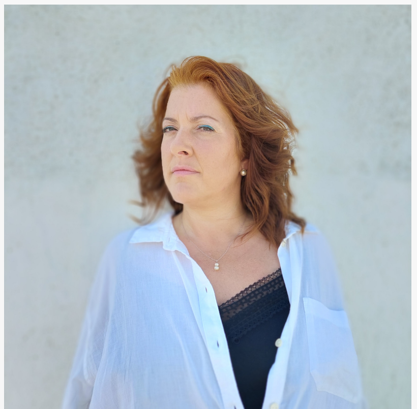
Award winning author speaks out on the bigotry still very much present in Britain

With the inclusion of her hedonistic raving days back in the late 1990s, many will be confused