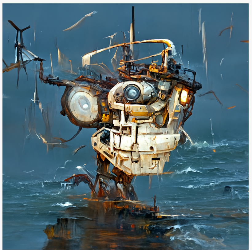
Artsy Monke 8865/10000. Oil Painting. Lost at Sea.