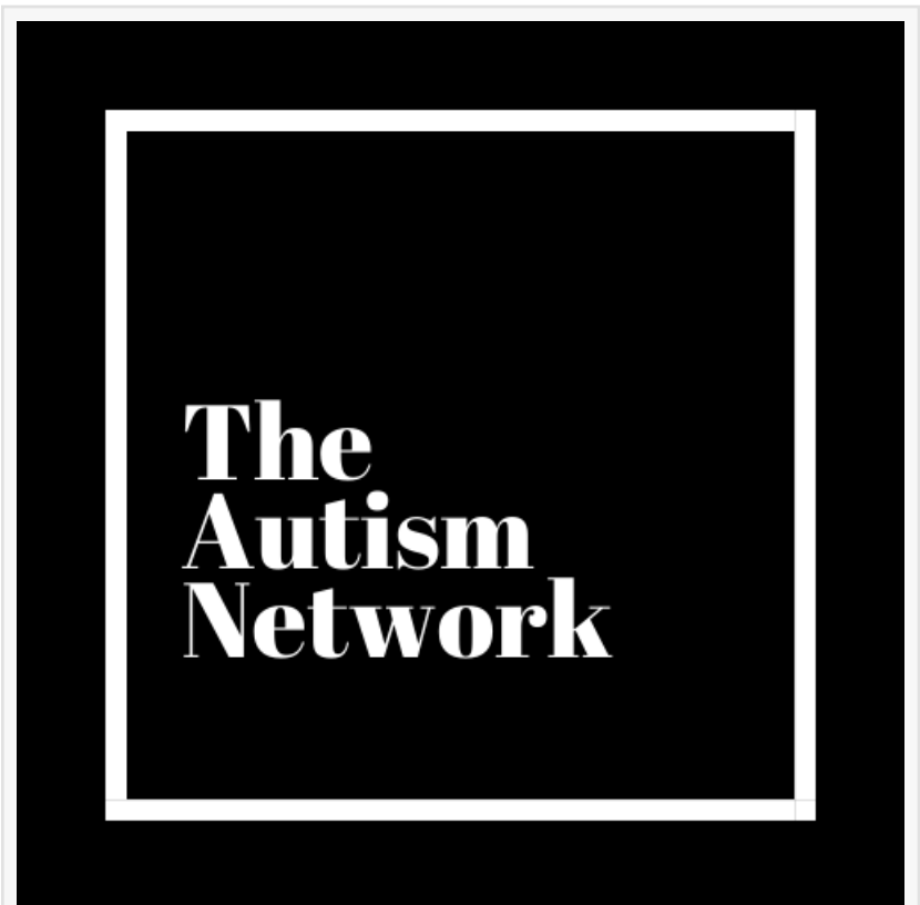
The Autism Network logo