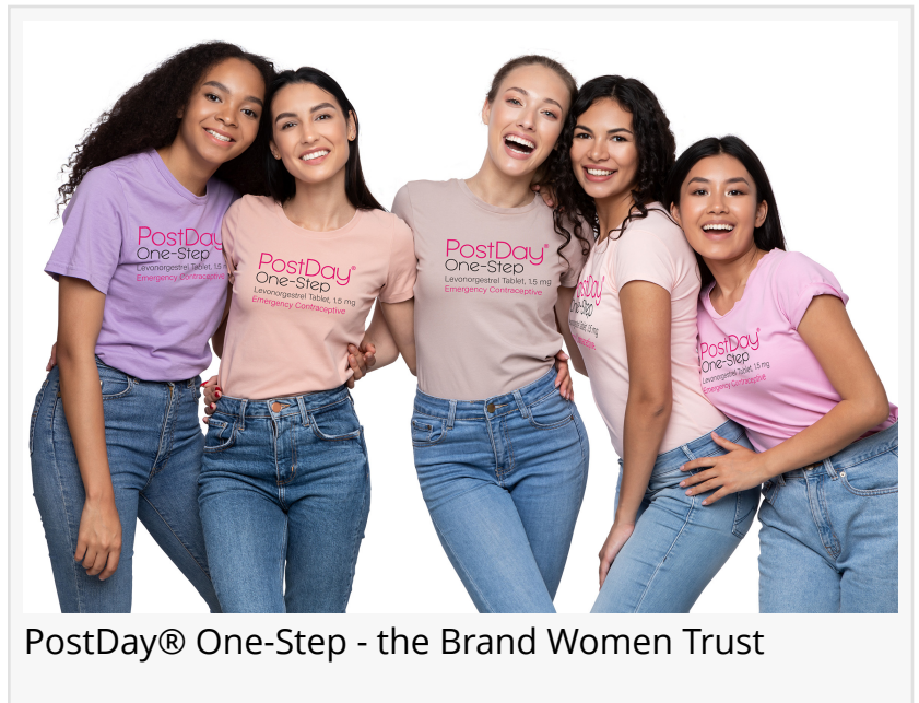
PostDay® One-Step - the Brand Women Trust

Clinical studies in thousands of women have shown that the emergency contraceptive is up to 87 percent effective in preventing pregnancy. No doctor prescription is necessary for PostDay® One-Step. There is no age or sex requirement and no ID is required to purchase the pill.