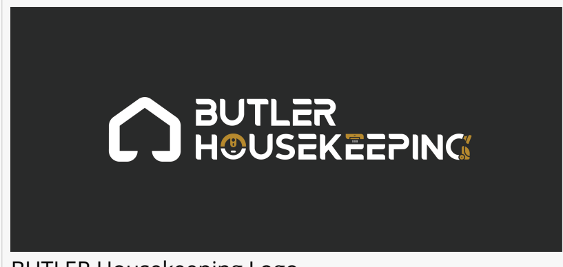
BUTLER Housekeeping Logo

providing the highest quality services to its clients and contributing to the well-being of society.