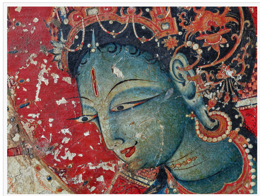
Vasudhara-Tara Detail: The Himalayan monastery of Alchi houses 11th-century Buddhist art of unparalleled beauty and finesse, such as the image of the green Vasudhara/Tara.

NEW YORK, NEW YORK, UNITED STATES, March 21, 2023 /EINPresswire.com/ -- Tibet House US announces "ALCHI: Visions of Enlightenment: Monumental Photographs by Peter van Ham," an exhibition running from April 20 to July 2, 2023. Visitors will be immersed in the rich, colorful, complex interior imagery of the world-famous Buddhist monastery of Alchi in Ladakh, India. Compelling iconography follows Buddhist philosophies that aim at enlightening religious experiences. The