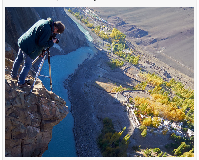
Peter van Ham documenting the ancient Himalayan temples of Alchi.

At an altitude of ten thousand feet nestled in a lush valley surrounded by the majestic Himalayas, the five temples of Alchi are among the oldest monastic buildings of the entire Tibetan cultural realm to survive till the present day.