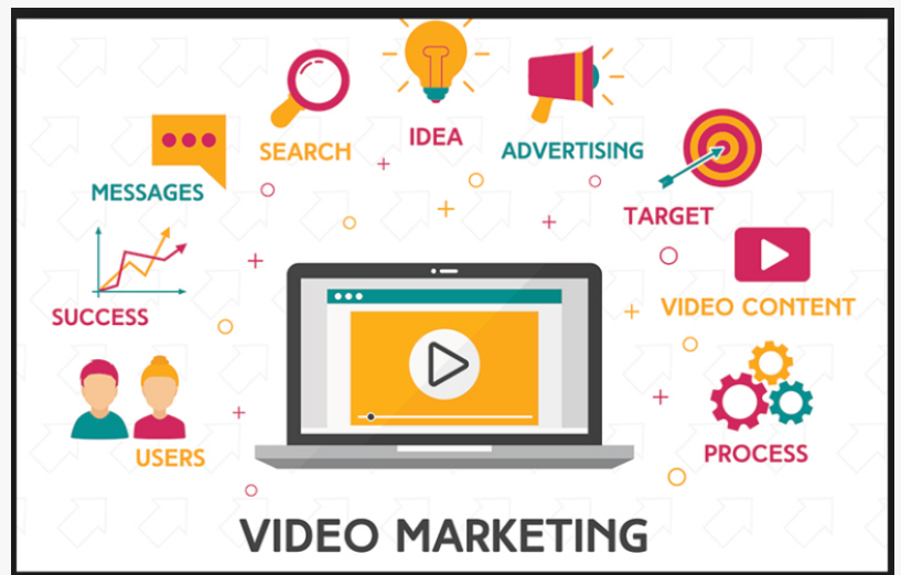
Video Marketing on YouTube