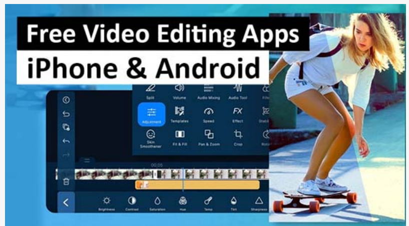
How to Edit Video on your Mobile Phone