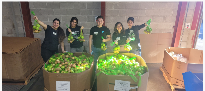
One Planet Group's team in Walnut Creek volunteering at a local food bank. 2022