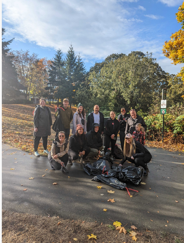
One Planet Group's Victoria team in action! Service Day 2022