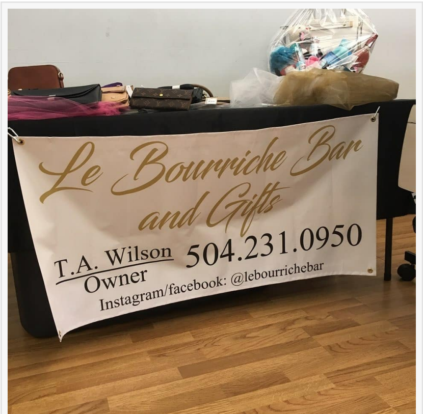
Le Bourriche Bar & Gifts 2nd Annual Grief Awareness Day is a way to let grieving parents know they are not forgotten.