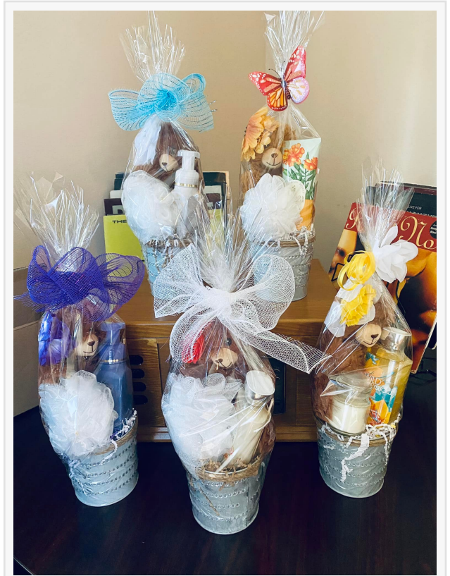
Gift baskets come n all sizes.

This press release can be viewed online at: https://www.einpresswire.com/article/623317272