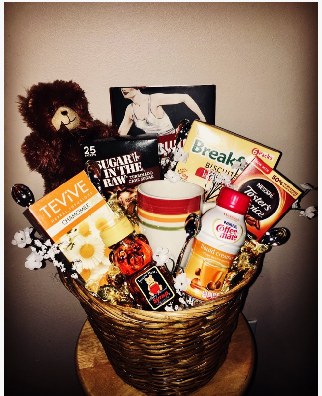
Le Bourriche Bar & Gifts specializes in gift baskets, and unique gift items.