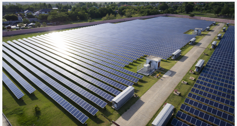
EA-SOLAR FARM (CALIFORNIA)