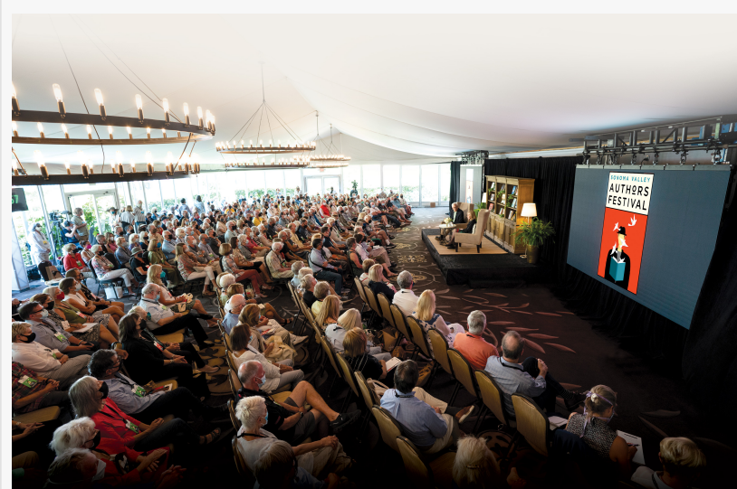
The main tent at the Sonoma Valley Authors Festival

opportunity to hear important authors and speakers and engage Festival listeners eager for thoughtful conversations.