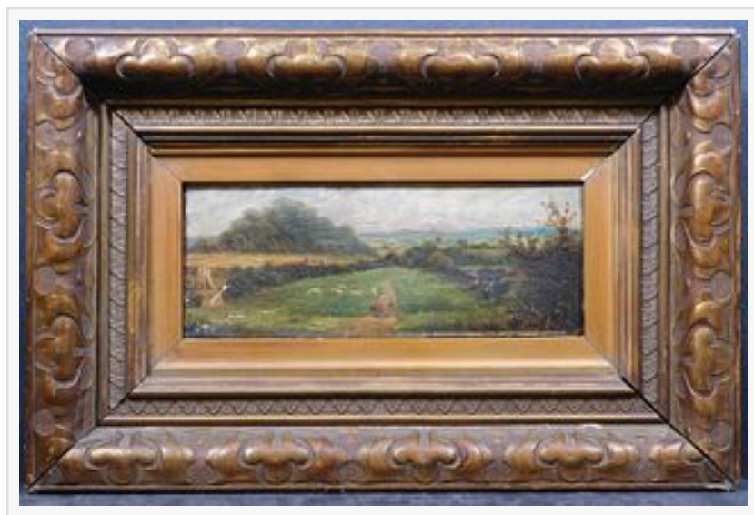
John Constable, Attributed: Blackberry Paysage

Leading this 201-lot sale is a landscape painting attributed to English artist John Constable (lot #66; estimate: USD 100,000 – $200,000). Titled Blackberry Paysage, this work is presented in an elaborate frame. 500 Gallery notes that the painting remains in overall very good condition with only slight areas of retouching and scattered areas of light craquelure. Constable lived and