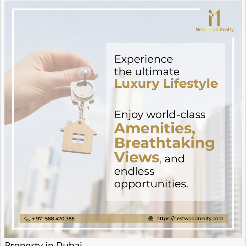
Property in Dubai