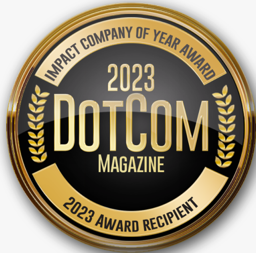
The DotCom Magazine Entrepreneur Spotlight Series- Impact Company

important video series, we consider the newsworthiness of the story and what our viewers want to learn about. If something is important to our viewers, it is important to DotCom Magazine. The people at DotCom Magazine believe in including a diverse range of entrepreneur voices in our interviews, and actively pursuing entrepreneurs making a positive difference in the world.