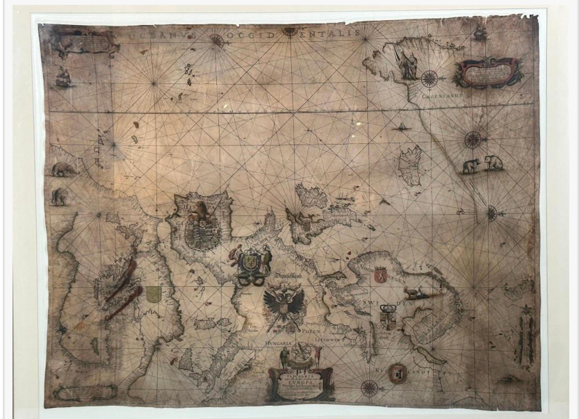
17th century Dutch Baroque map titled Pascaarte van alle de Zecusten van Europa by Anthonie Jacobsz, rare and obscure, made on animal skin vellum ($36,900).