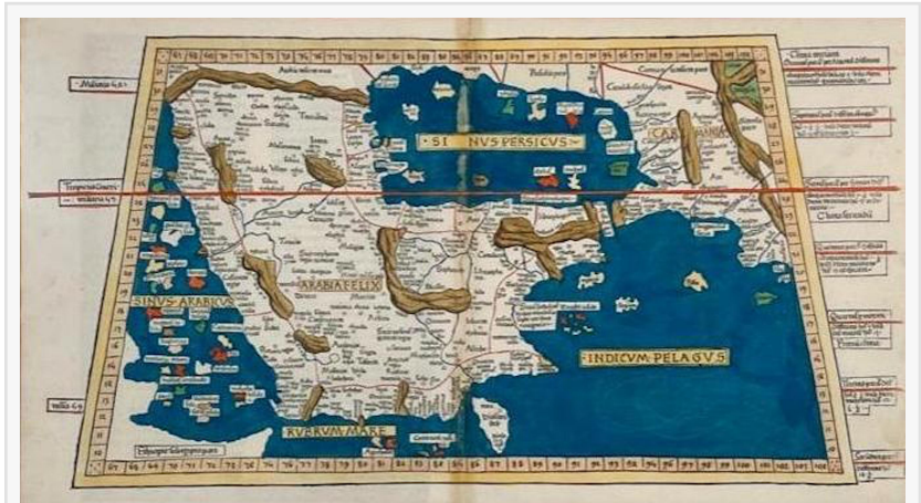
Colorful map of the Persian and Red Seas, after Claudius Ptolemy, Geographica, circa 1482 or later, 12 ½ inches by 22 inches (sight, less frame) ($110,700).

By far the top lot of the auction was a map of the Persian and Red Seas, after Claudius Ptolemy, Geographica, circa