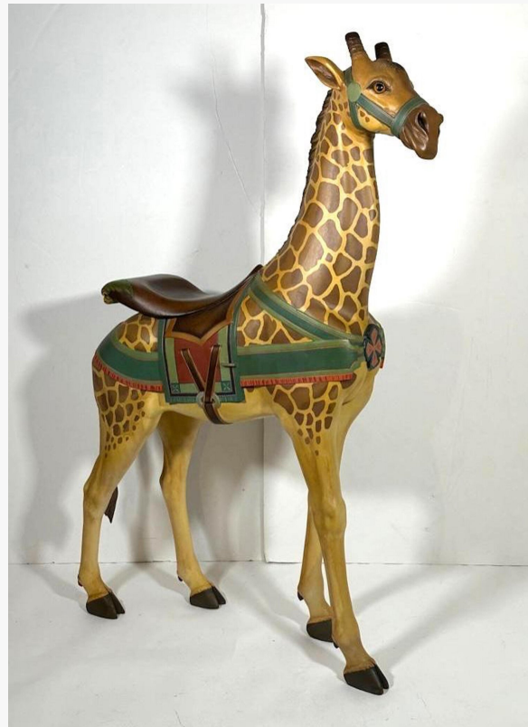
Carved and painted carousel giraffe, crafted circa 1910 by Gustav and William Dentzel, professionally restored, 64 ½ inches tall with inset glass eyes ($9,840).

The sale's expected top lot was the unusual but rare and visually striking carved and painted carousel giraffe, crafted circa 1910 by Gustav and William Dentzel. The restored giraffe, 64 ½ inches tall, featured inset glass eyes and was saddle carved with eagle's heads and green and red painted saddle details. It sold near its high estimate of $10,000.