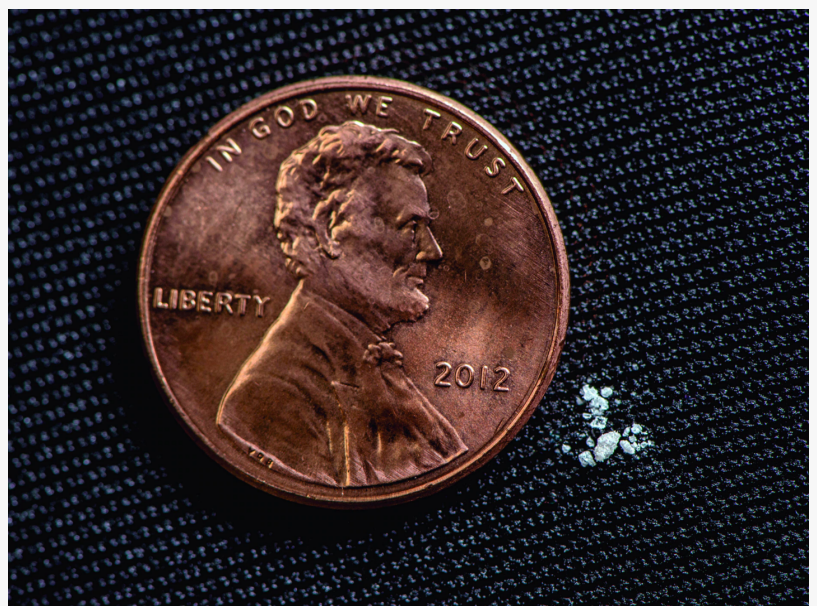
Lethal dose of fentanyl versus a penny.

We have seen on the news that opioid addiction in the United States has risen sharply over the past twenty years from under 20,000 in 1999 to over 100,000 in 2019, according to the National Institute on Drug Abuse. The cause is the increased drug trafficking of fentanyl and fentanyl-laced pills into the United States from China and through Mexico.