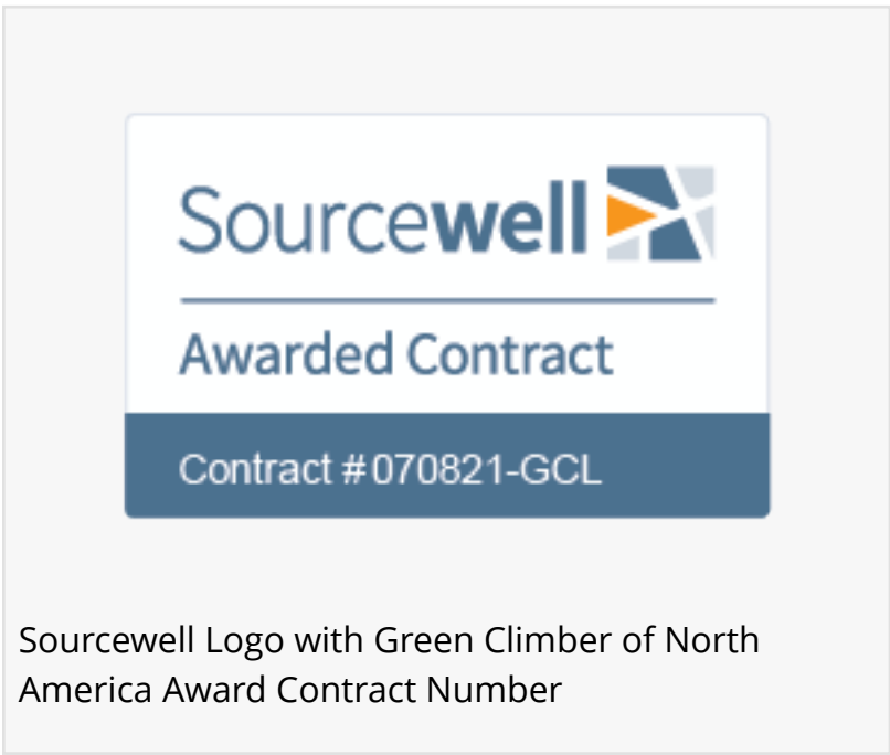
Sourcewell Logo with Green Climber of North America Award Contract Number

BURR RIDGE, IL, USA, April 11, 2023 /EINPresswire.com/ -- Green Climber of North America ( GCNA ) has been awarded the Sourcewell right of way mowing contract for their Green Climber slope mower line. Now educational, municipal, and nonprofit organizations can easily purchase Green Climber remote controlled slope mowers at pre-established prices. This makes the buying process easier for registered users as Sourcewell fulfils the extensive bidding process for equipment procurement.