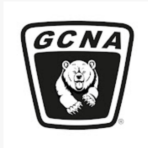
Green Climber of North America Logo