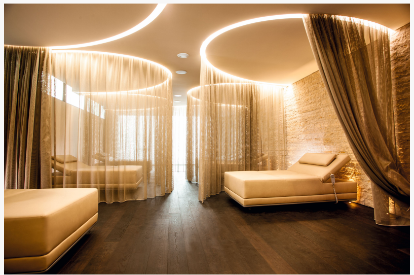
Relaxation and rest is key to any wellness program.

The SWAY is an addition to an at-home wellness suite, commercial spa, fitness center/gym, or as a stand-alone wellness station for rest and recovery at a conference or trade show. It can also be deployed as a workplace wellness amenity for promoting creativity and concentration during the workday. To learn more about the SWAY, visit www.klafsusa.com/sway ; email info@klafsusa.com for commercial pricing.