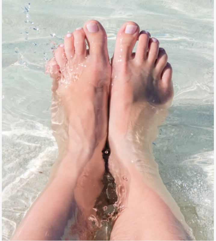
FEET ON WATER