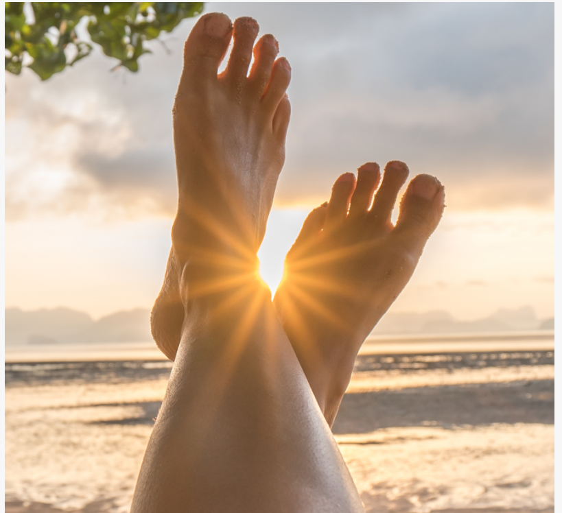
FEET AND SUNSET

This press release can be viewed online at: https://www.einpresswire.com/article/623735299 EIN Presswire's priority is source transparency. We do not allow opaque clients, and our editors