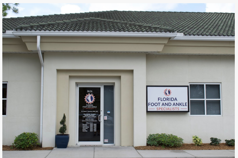
Florida Foot office