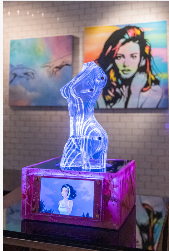
Venus sculpture sound activated light show to the touch screen tablet