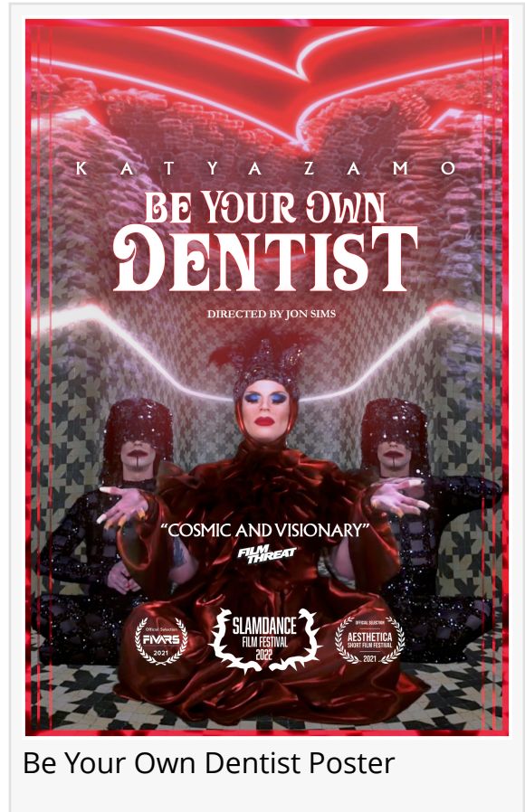
Be Your Own Dentist Poster

This press release can be viewed online at: https://www.einpresswire.com/article/623959642